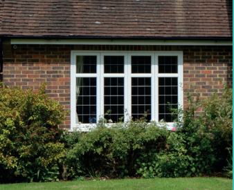
Timber Entrance Doors and Windows