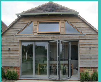
Aluminium Bi-fold and Patio Doors