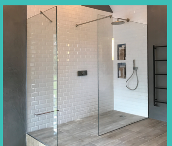
Glass Balustrades, Splashback and Showerscreens