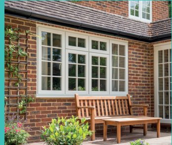
Timber Alternative Windows