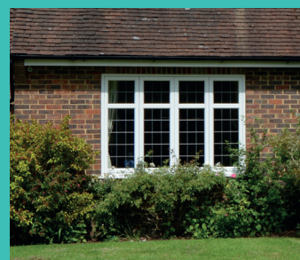
Timber Entrance Doors and Windows