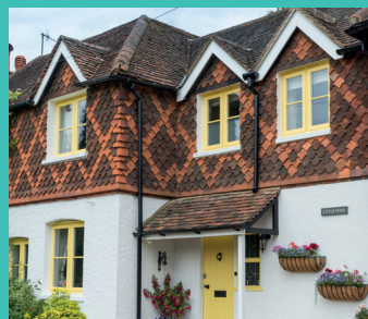
Timber Alternative Windows

P&P endeavour to offer the widest range of home improvement products to their loyal and discerning customers. Here are just some of our high-end options available.