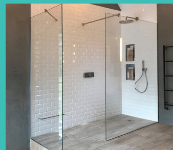
Glass Balustrades, Splashback and Showerscreens