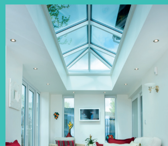
Roof Lanterns and Flat Rooflights