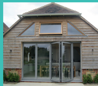
Aluminium Bi-fold and Patio Doors